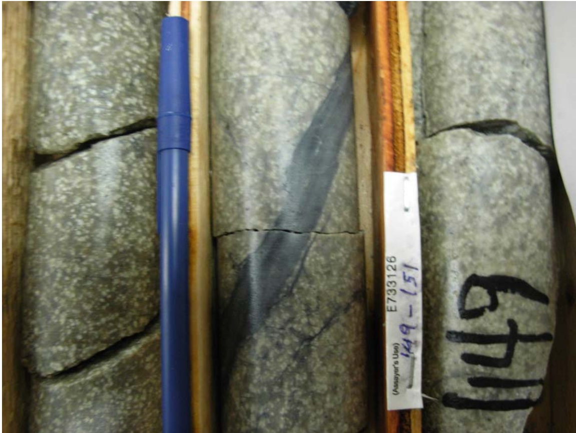
Plate 1. Banded quartz-molybdenite vein in fine-grained feldspar porphyry at 148.1 metres depth, drill hole LL07-10 (vertical drill hole).